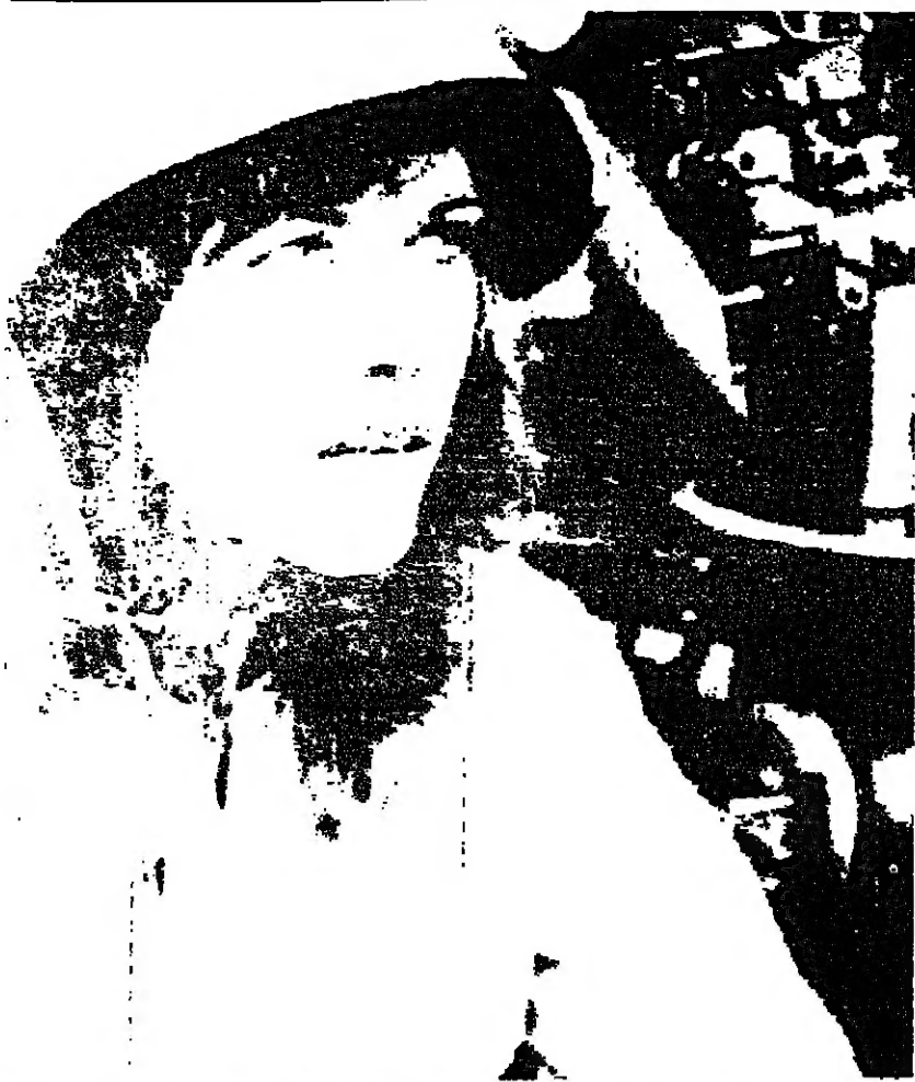
Film star Jane Fonda, visiting Hanoi, poses in a steel helmet at an anti-aircraft gun.

If cat and mice could live quietly so should Vietnamese: a parable greatly to the villagers' taste, but as unacceptable to the Communists as it is to the Saigon leadership.